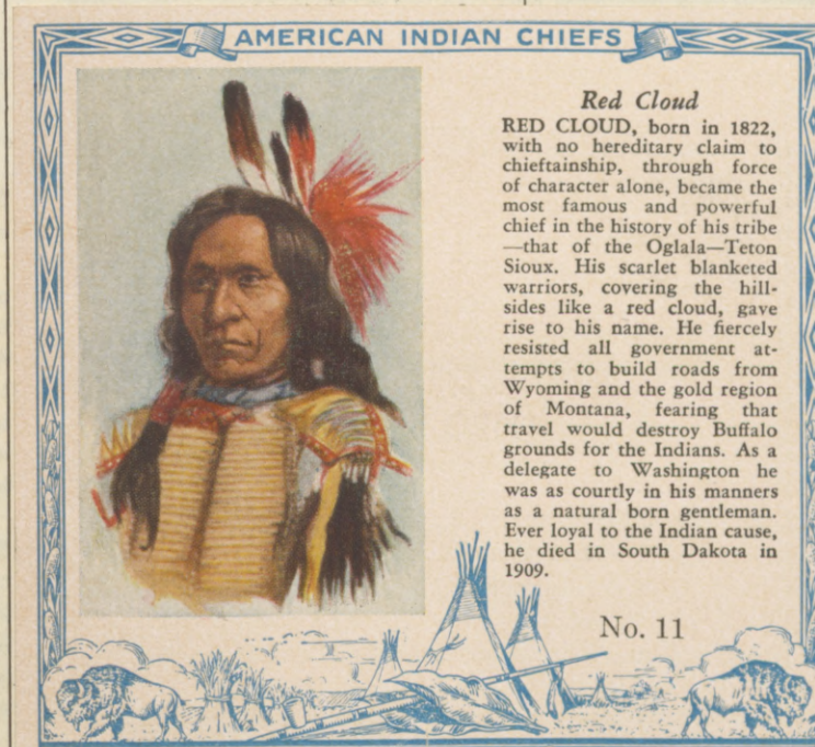
Red Cloud RED CLOUD, born in 1822, with no hereditary claim to chieftainship, through force of character alone, became the most famous and powerful chief in the history of his tribe—that of the Oglala-Teton Sioux. His scarlet blanket warriors, covering the hill-sides like a red cloud, gave rise to his name. He fiercely resisted all government attempts to build roads from Wyoming and the gold region of Montana, fearing that travel would destroy Buffalo grounds for the Indians. As a delegate to Washington he was as courtly in his manners as a natural born gentleman. Ever loyal to the Indian cause, he died in South Dakota in 1909.