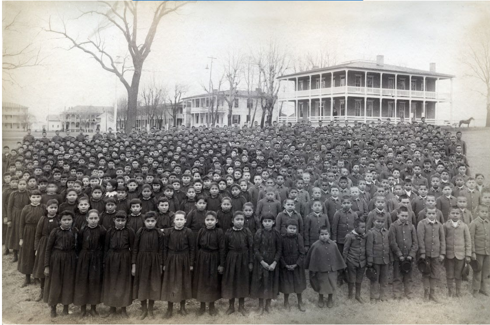
Group photo of the Entire Student Body at the Carlisle Indian School, 1892

Tens of thousands of young people from Indian communities all across America were sent to the Carlisle Indian School in Pennsylvania between 1879-1918. What was the purpose, the strategy, the outcome? What can we learn from interrogating this historical, educational experiment about the goals of its founders, the students who were sent there, the impact on their families and communities, U.S. military and domestic policy related to Indian tribes, the history of American education, about race and ethnic relations?