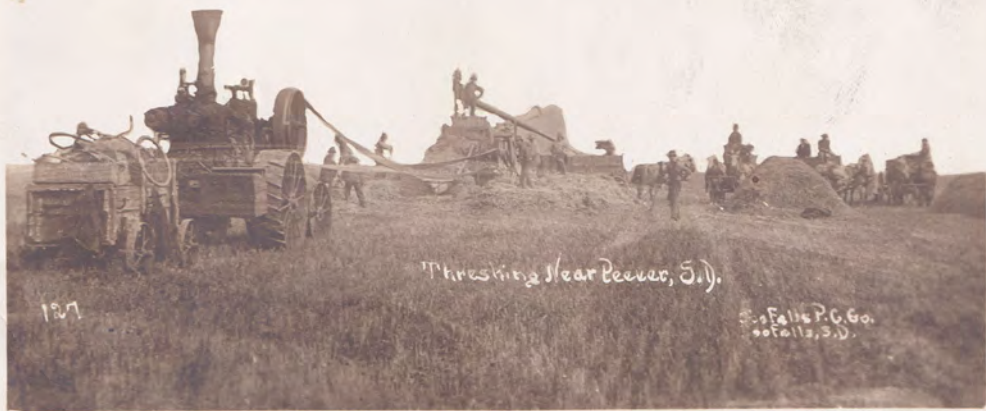
Threshing Near Beaver, S.D.