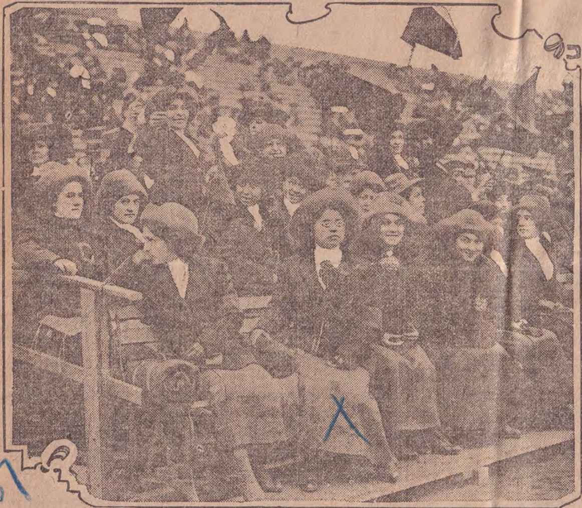
Don't accept the statement that the American Indian is a stoic until you have looked upon the above picture—a photograph showing a group of Carlisle Indian school girls, cheering the school's famous football eleven. The girls are intensely interested in the playing of the team and many attend the games and cheer their representatives on to victory.