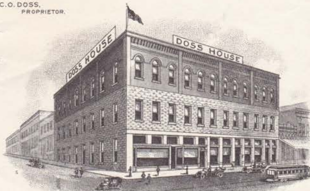
ABSOLUTELY MODERN, POPULAR PRICED HOTEL