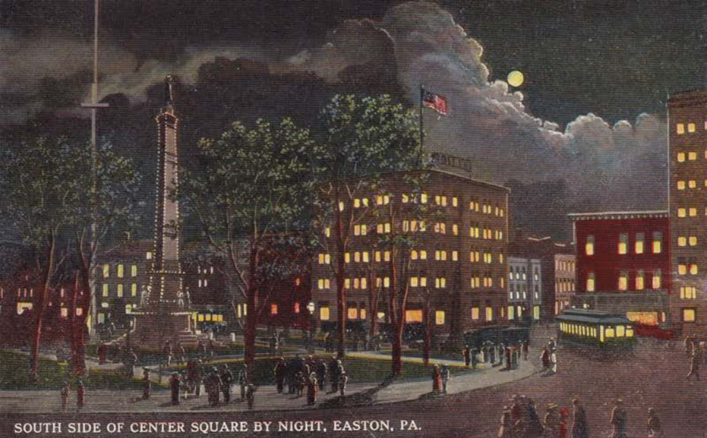
SOUTH SIDE OF CENTER SQUARE BY NIGHT, EASTON, PA.