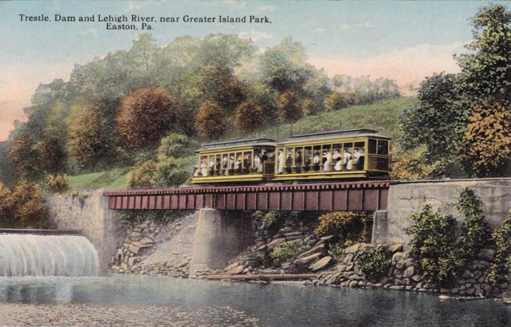
Trestle, Dam and Lehigh River, near Greater Island Park, Easton, Pa.

an I am pulling for home or some where in North Carolina now I was not a bad boy not as much as they thought I was, they thought too much I never left from there. Sunday I leave here for home. I cost $4.00 a day $24.00 a week. Good by from Pennon. That lady put to much about me I should stay there