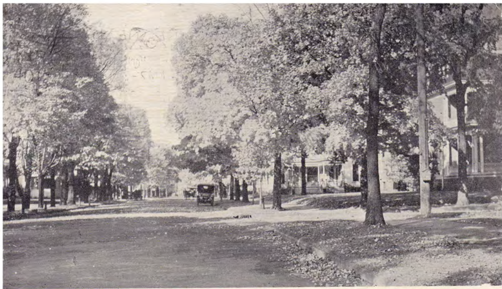
Main Street, Racine, Wis.