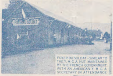
FOYER DU SOLDAT - SIMILAR TO THE Y.M.C.A. HUT, MAINTAINED BY THE FRENCH GOVERNMENT WITH AN AMERICAN Y.M.C.A. SECRETARY IN ATTENDANCE