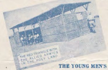
THE RED TRIANGLE WITH THE ALLIED ARMIES IN THE HOLY LAND