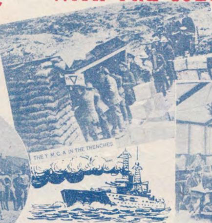
THEY M.C.A. IN THE TRENCHES