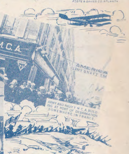
ARMY AND NAVY Y.M.C.A. BUILDING AT PORT OF DEPARTURE SOMEWHERE IN FRANCE.