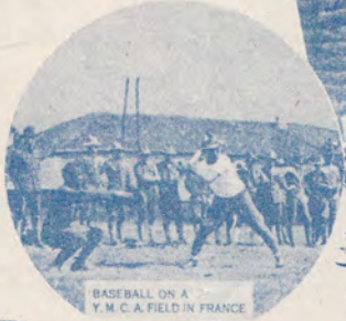
BASEBALL ON A Y.M.C.A. FIELD IN FRANCE