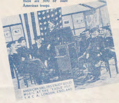
AMERICAN SAILORS ENJOY GOOD MUSIC AT THE 'EAGLE HUT' Y.M.C.A. LONDON, ENGLAND

But I think I will like it as if I were in Camp Jackson, and we having barrack like we did in Camp Jackson and here we are in tent now.