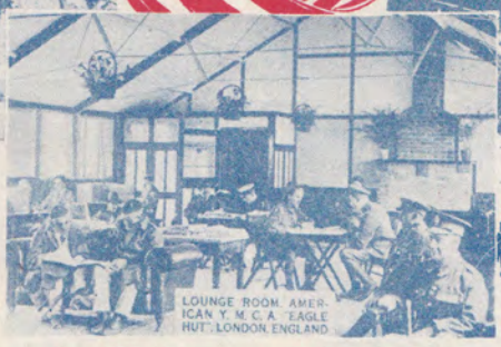
LOUNGE ROOM AMERICAN Y.M.C.A. 'EAGLE HUT', LONDON, ENGLAND