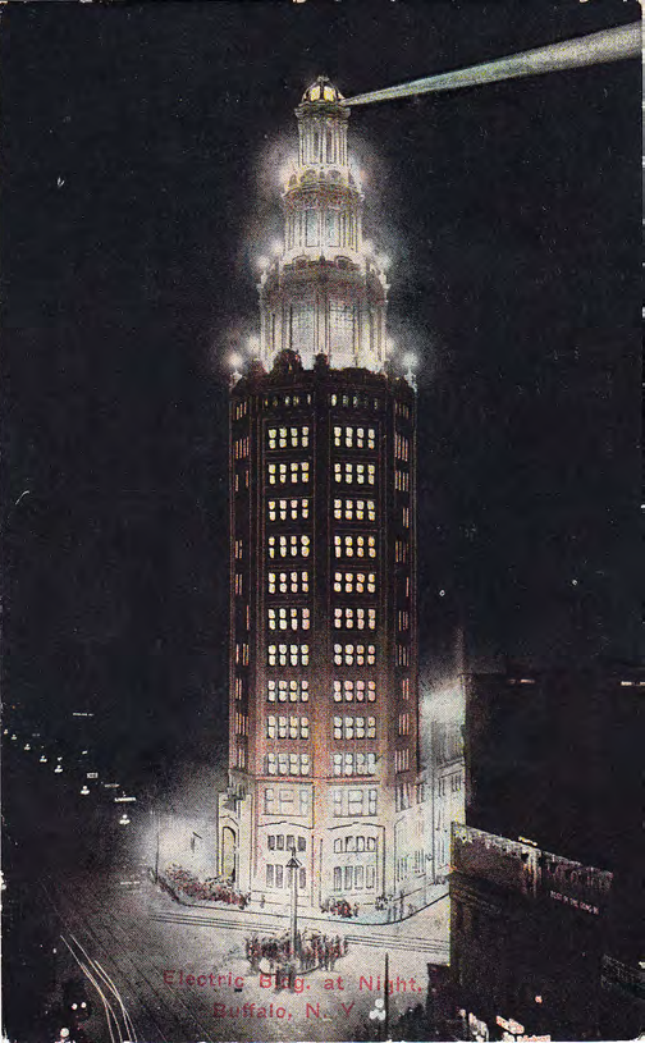
Electric Bldg. at Night. Buffalo, N. Y.