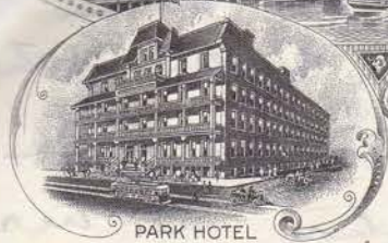
PARK HOTEL SAULT STE. MARIE, Mich.

PARK HOTEL AND BATH PALACE HOT SPRINGS, ARK.