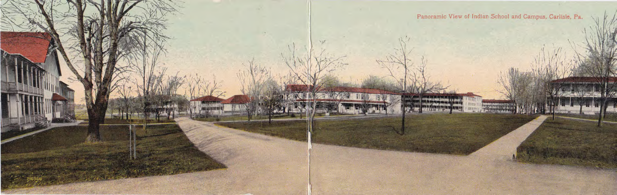
Panoramic View of Indian School and Campus, Carlisle, Pa.