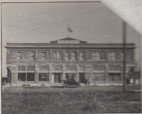
West De Pere, Wis.