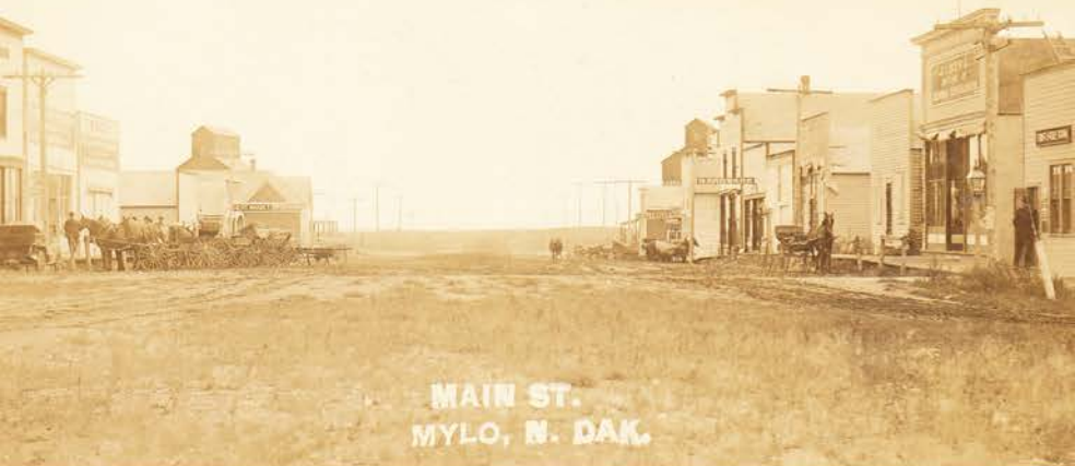
MAIN ST. MYLO, N. DAK.

Dear Supt, I rec'd the money and also the last letter and I'll forward the money, but I don't think that it is right. She didn't give me any wages for the last mo. Love to all.