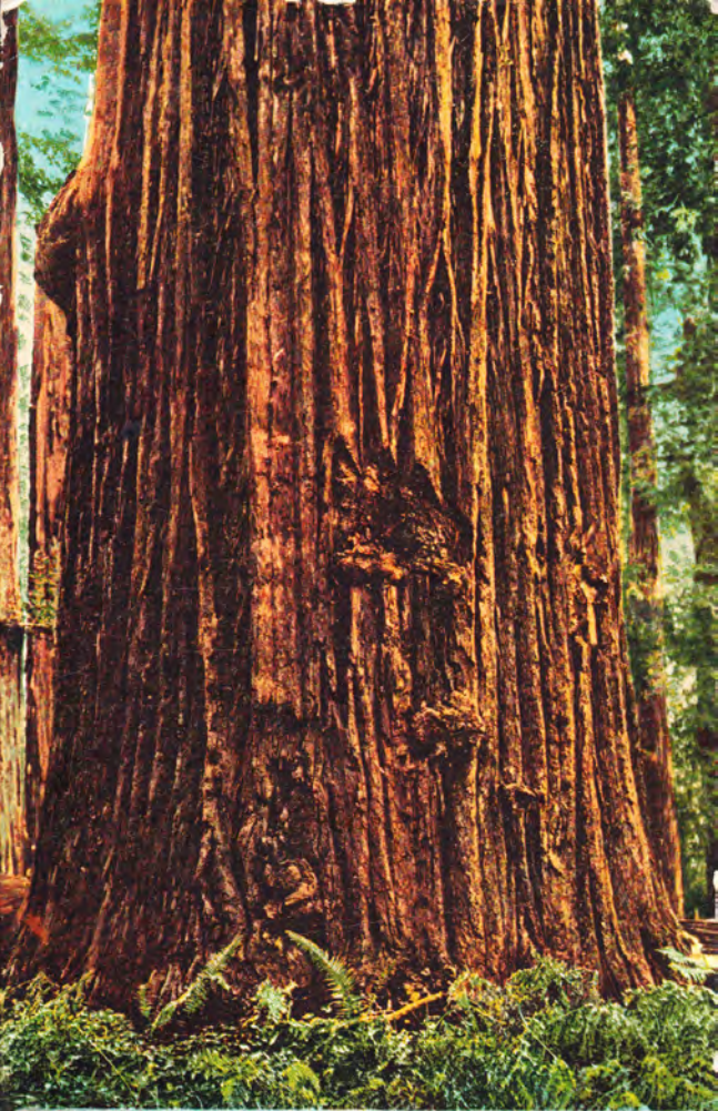
2597 - Giant Redwood near Eureka, California. 44 Ft. Circumference.