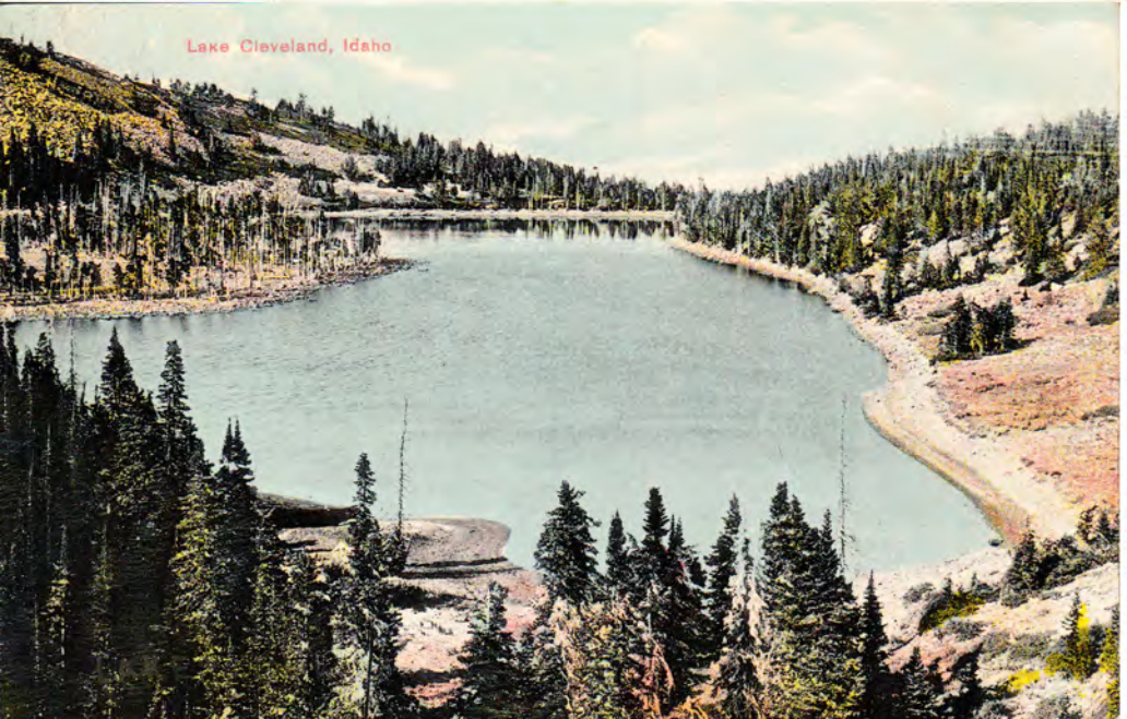
Lake Cleveland, Idaho