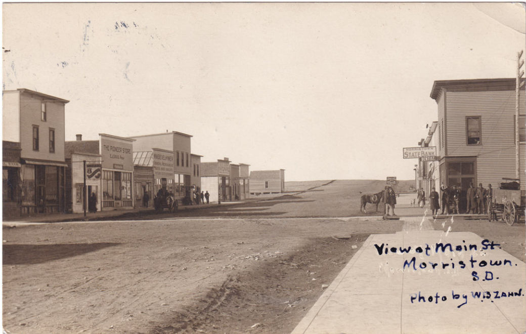
View of Main St. Morrissetown. S.D.