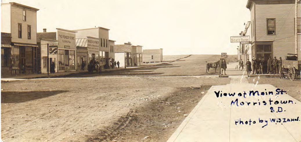
View of Main St. Morrystown. S.D.