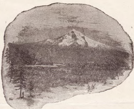
MT. HOOD OREGON, HEIGHT 11225 FT.