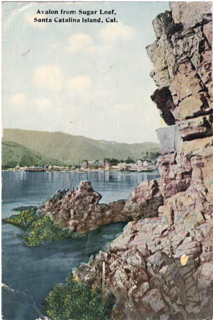
Avalon from Sugar Loaf, Santa Catalina Island, Cal.