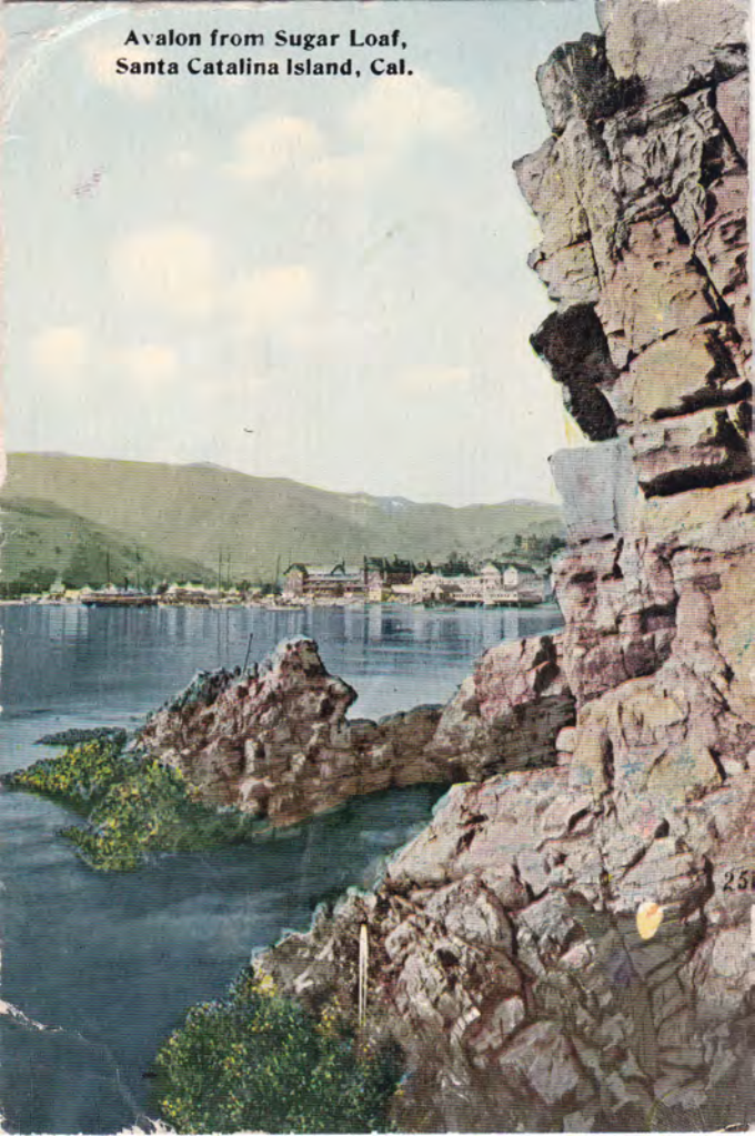
Avalon from Sugar Loaf, Santa Catalina Island, Cal.