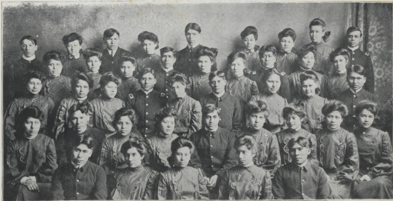
GRADUATING CLASS 1905.