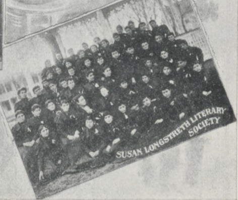
SUSAN LONGSTRETH LITERARY SOCIETY