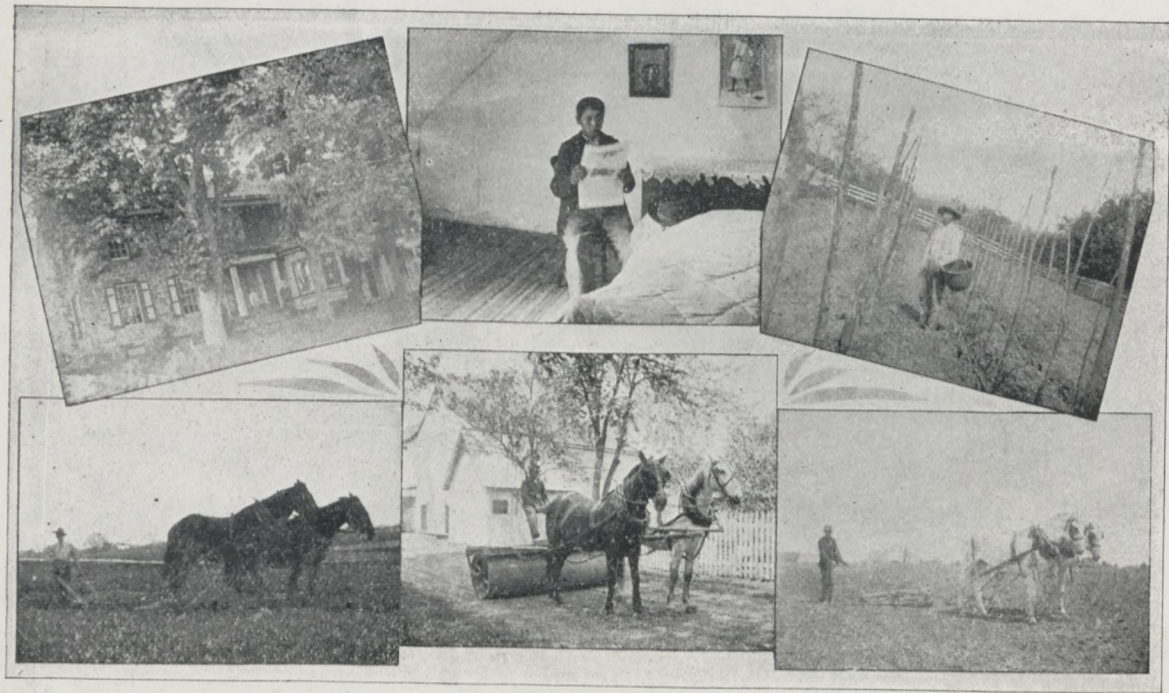
BOYS IN THE COUNTRY UNDER OUTING SYSTEM.