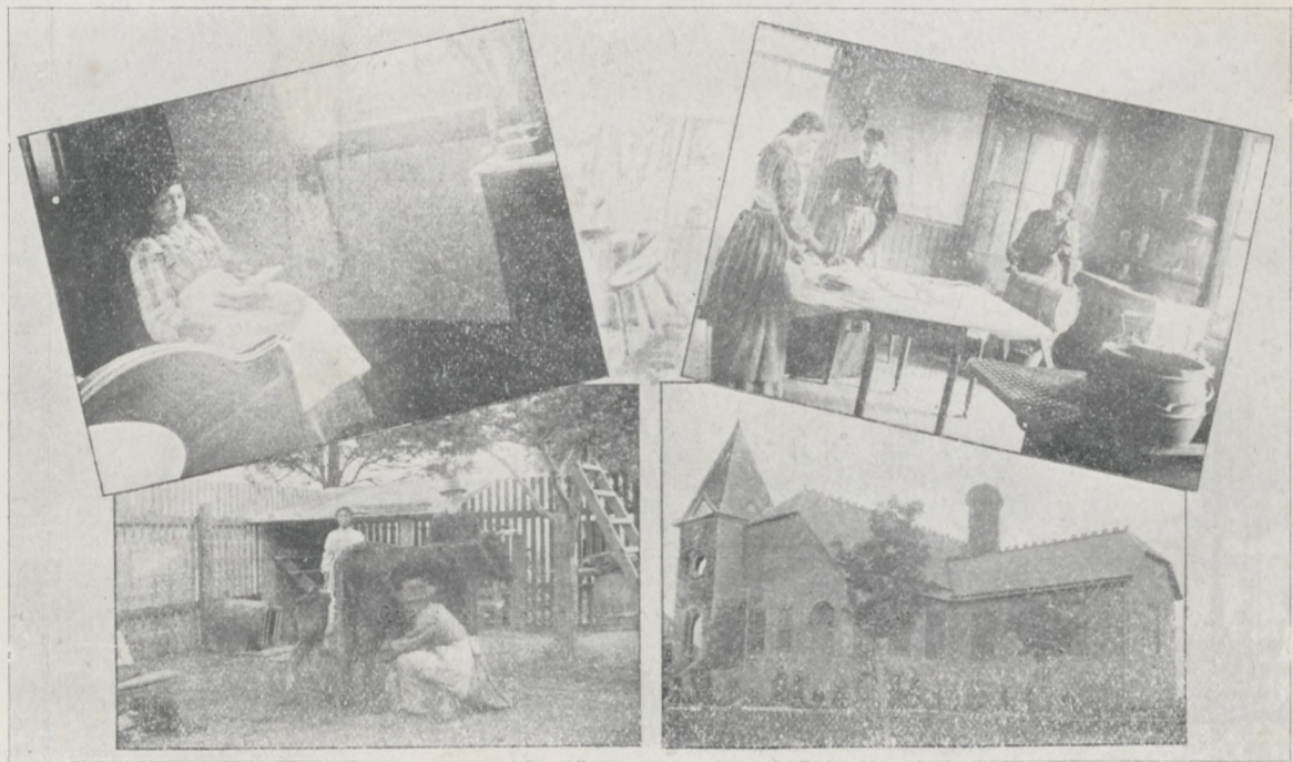
GIRLS IN THE COUNTRY UNDER OUTING SYSTEM.