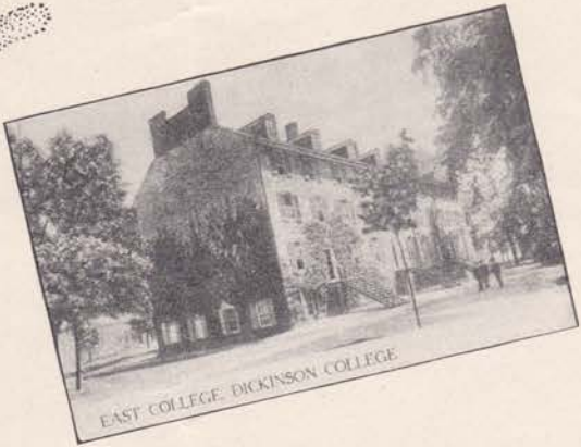
EAST COLLEGE, DICKINSON COLLEGE