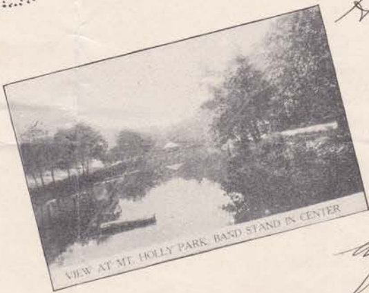
VIEW AT MT. HOLY PARK BAND STAND IN CENTER

Hon. Cato Sells, Commissioner of Ind. Affairs, Washington D. C.