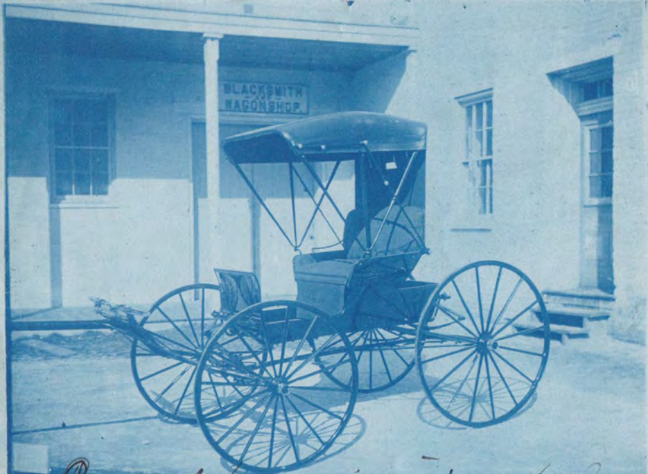
Concord buggy is similar to this.