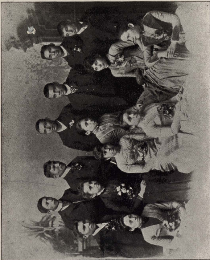
Class of 1889