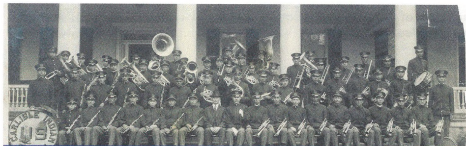
"The Carlisle Indian School Band in 1915"